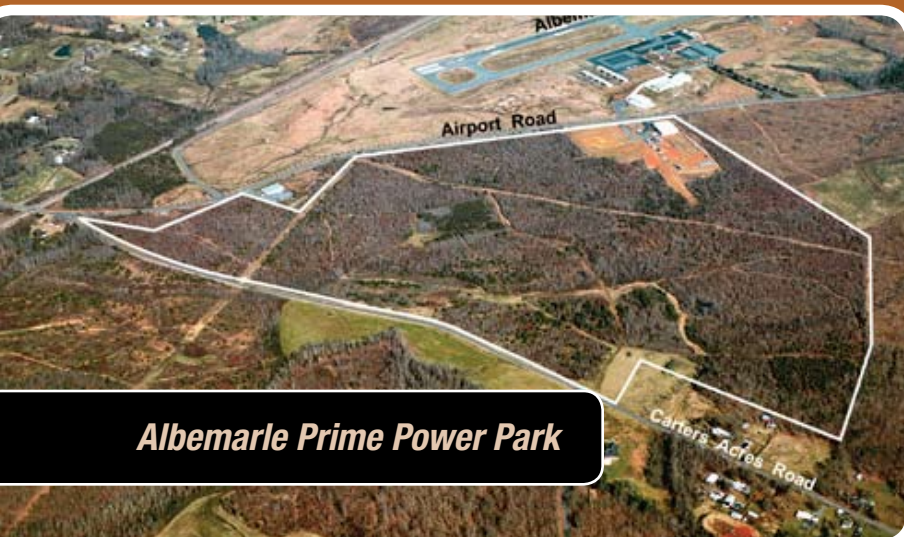
Albemarle Prime Power Park

Prime Power Park tenants will also enjoy affordable and flexible rates from the City of Albemarle or City of Gastonia, both North Carolina Public Power communities. And, of course, all the business-friendly benefits our right-to-work state is known for.